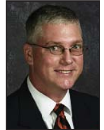
Started at Rice: 1993 BA 'Religious Studies' University of San Diego MA 'Theology' Boston College