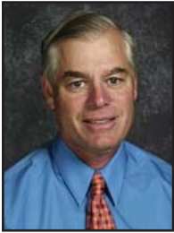
Started at Rice: 1985 BA 'Religious Studies' Holy Cross MA 'Religion & Society' Drew University