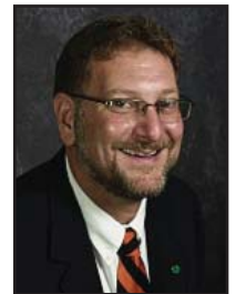
Started at Rice: 1997 BA 'English/History' Oakland University