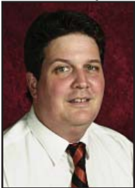
Started at Rice: 2007 BS 'Education' Wayne State University Central Michigan University