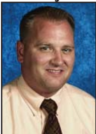
Started at Rice: 2006 BA Western Kentucky MA 'School Administration' Madonna University