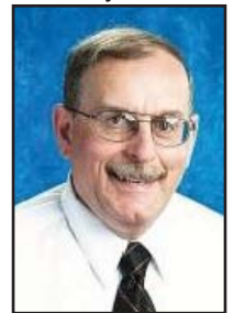
Started at Rice: 1985 BA University of Detroit Marygrove College