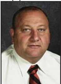
Started at Rice: 2005 BA 'History' Madonna University MA 'Religious Studies' Sacred Heart Major Seminary